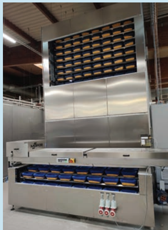
Poland again, just 25 years later...

In all modesty we can proudly proclaim today that we have pulled it off successfully. Our decision to hang on to the Eastern markets in times when all others had been leaving them en masse paid off. Big contracts from Russia and other formerly communist countries helped to make our company stable. Gradually we turned our focus on industrial, high-performance continuous lines for forming, proofing and cooling a wide range of bakery products including formed and toast breads, pastry, pizza, ciabatta, pretzels and other bakery products. Our production lines are tailored to individual customers not only to fit into the specific layouts of their production halls (proofers passing through two floors are no exception) but also to meet their