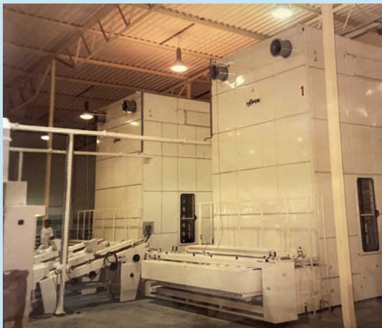
90’s – two bread-producing lines in Poland