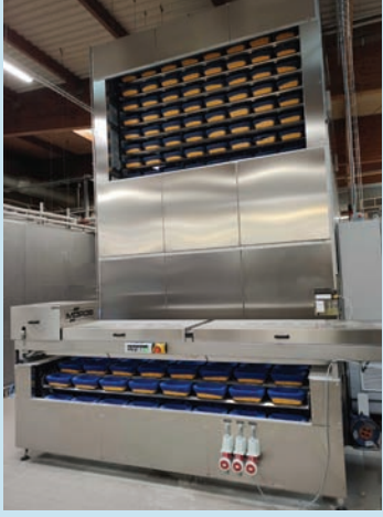
Poland again, just 25 years later...