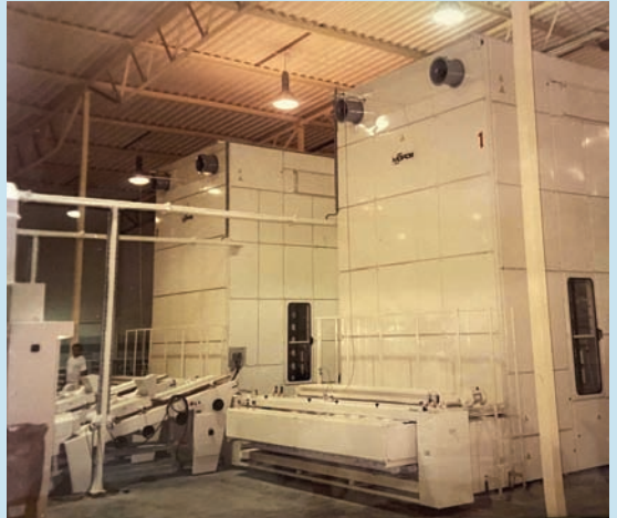
90's – two bread-producing lines in Poland

In all modesty we can proudly proclaim today that we have pulled it off successfully. Our decision to hang on to the Eastern markets in times when all others had been leaving them en masse paid off. Big contracts from Russia and other formerly communist countries helped to make our company stable. Gradually we turned our focus on industrial, high-performance continuous lines for forming, proofing and cooling a wide range of bakery products including formed and toast breads, pastry, pizza, ciabatta, pretzels and other bakery products. Our production lines are tailored to individual customers not only to fit into the specific layouts of their production halls (proofers passing through two floors are no exception) but also to meet their